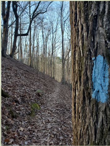
Pinhoti Trail (Blue Blazes)