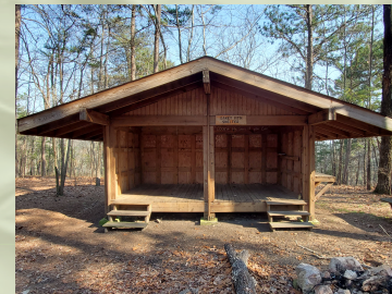
Oakey Mountain Shelter Turn Around